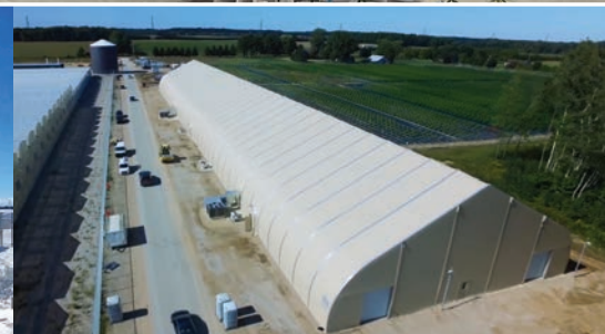
Warehousing and Processing