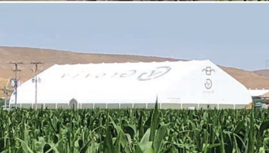
Controlled Environment Agriculture