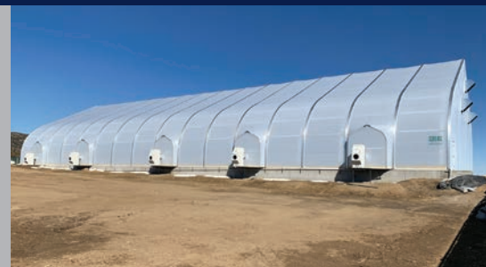
Cannabis Grow Facility