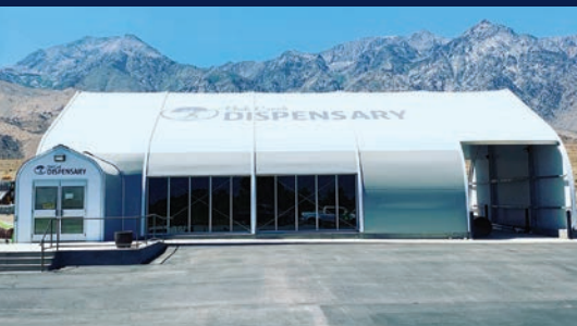
Retail and Administration