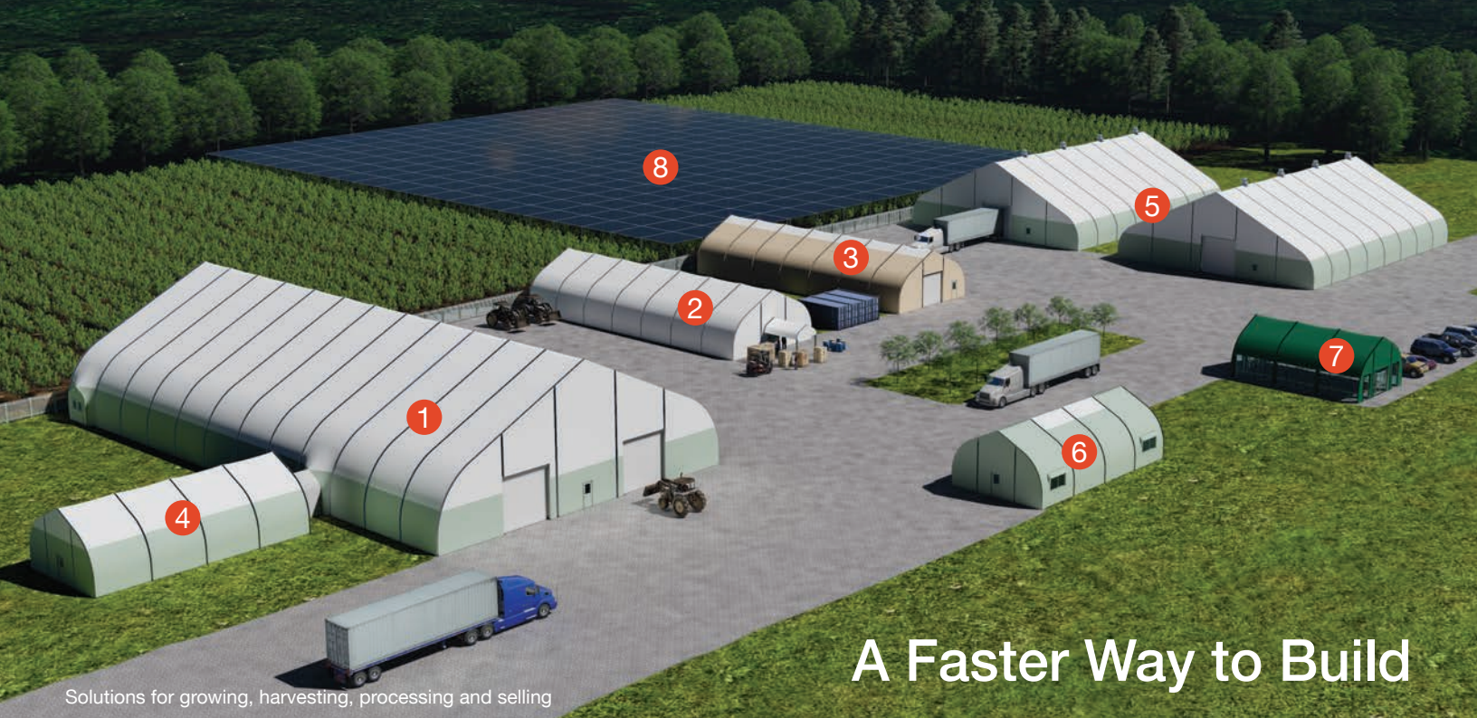
Solutions for growing, harvesting, processing and selling