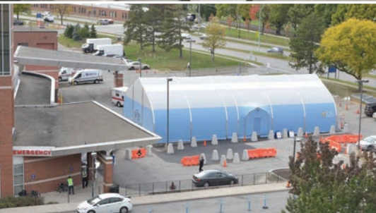
Lease or purchase