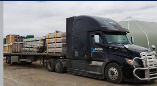
Immediate delivery from inventory