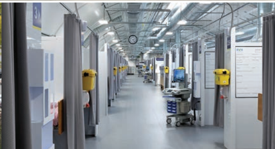
Large clearspan interiors