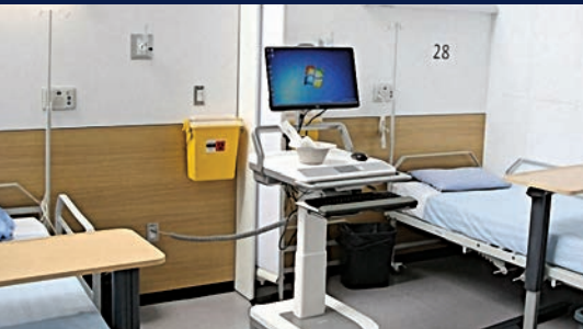
Interior space can be reconfigured as needed