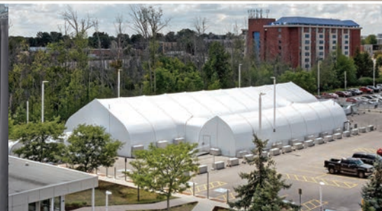
Limited foundation requirements